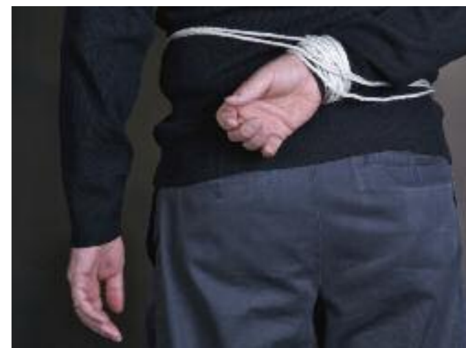
RPs left with some difficult options

Whilst this episode in itself, does not signify that there has been a wholesale policy change at the NPA in relation to RP liability, it nevertheless is the first time in our experience that the RP regulations have been cited as a justification for passing 100% of the liability across to another pharmacist, where the error was actually committed by the owner some days earlier.