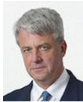
Health Secretary Andrew Lansley

There are currently approximately 8,000 GP practices and it is envisaged that the responsibility for directing patients' care will be transferred to about 500 consortia of GPs.