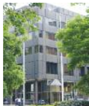
RPSGB - a tough regulator

It is against this backdrop that we wish to describe the lengths that the RPSGB will go to in pursuing an ordinary pharmacist who has served the profession with dignity for forty years and decided to (legitimately) retire from the profession because she was so distressed by the manner in which she was subjected to a disciplinary investigation.