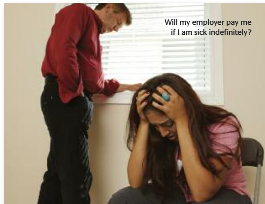
Will my employer pay me if I am sick indefinitely?

I was struck by a posting that I saw on Locum Voice - an electronic community for pharmacy locums. The posting was made just after we had launched The PDA Plus brochure in which we brought our members attention to the PG Income Protection Plan. The 'poster' was a young healthy woman who