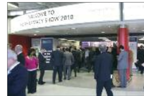
Last year's successful conference

A: Several. For starters, we've introduced a sixth conference - the Clinical Forum - focusing on major disease areas. As pharmacists are spending more time with patients discussing their medicines, whether it's part of the new medicines service, doing MURs or running services, pharmacists have told us they want more clinical education. The exhibition will be the biggest we've ever seen, with more than 50 new suppliers exhibiting for the first time. Our special events programme has expanded enormously with most of the key industry organisations and