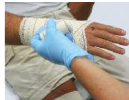
Will your employer pay you a percentage of your salary indefinitely if you are off sick?

A more robust medical test, the Work Capability Assessment, designed to see whether claimants have the ability to perform any form of work, is already in place. Nearly 80 per cent of PDA members surveyed are unaware that state benefits are 'any occupation' and can be stopped if you are unable to perform any work, regardless of your professional career. Reassuringly, PG can cover a pharmacist until they are able to resume their pharmacy career – one of the benefits of joining a society that specialises in your profession.