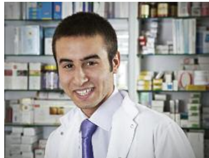
Around 900 pharmacists have failed to reach GPhC minimum standards in their CPD.

The GPhC reports that nearly 2 per cent of pharmacists do not achieve a high enough score. These figures may seem low, but 2 per cent of the register is around 900 pharmacists.