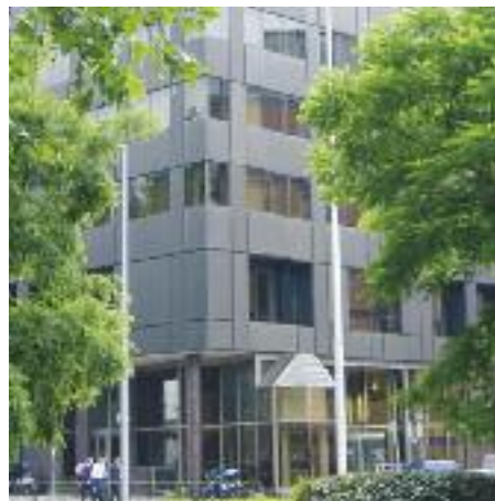
Question mark over RPSGB commitment