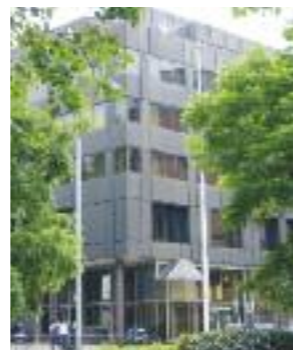
RPSGB - a tough regulator

It is against this backdrop that we wish to describe the lengths that the RPSGB will go to in pursuing an ordinary pharmacist who has served the profession with dignity for forty years and decided to (legitimately) retire from the profession because she was so distressed by the manner in which she was subjected to a disciplinary investigation.