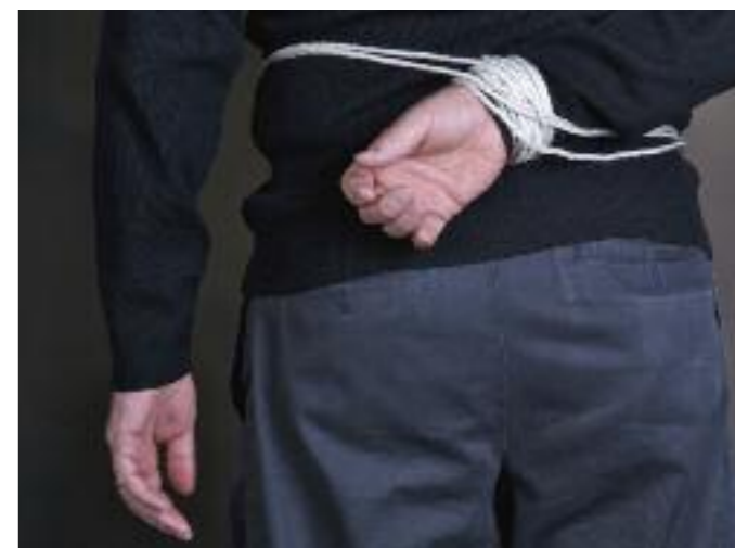
RPs left with some difficult options

Whilst this episode in itself, does not signify that there has been a wholesale policy change at the NPA in relation to RP liability, it nevertheless is the first time in our experience that the RP regulations have been cited as a justification for passing 100% of the liability across to another pharmacist, where the error was actually committed by the owner some days earlier.