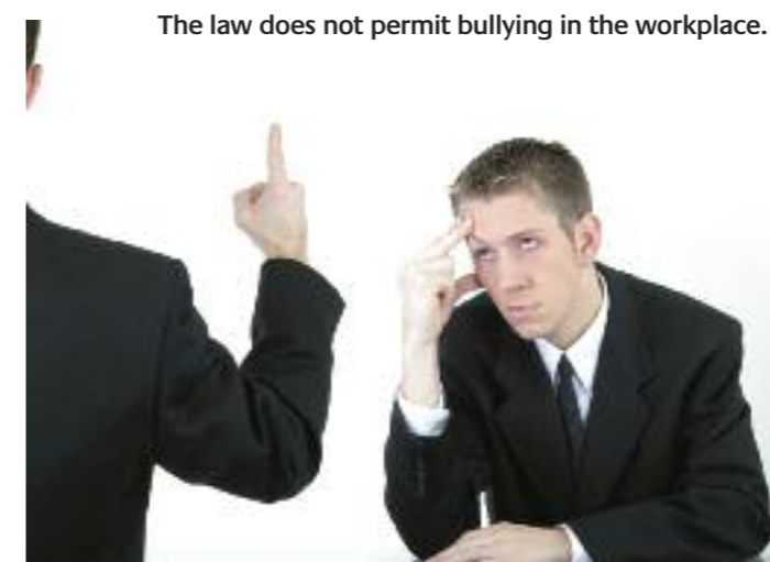
The law does not permit bullying in the workplace.

As a direct result of the PDA’s intervention, the non-pharmacist store manager was disciplined for gross misconduct and removed from his managerial position. Both of these examples show that by using established employment processes along with support from the PDA, pharmacists can protect themselves from the bullying behaviour that seems prevalent in some organisations.